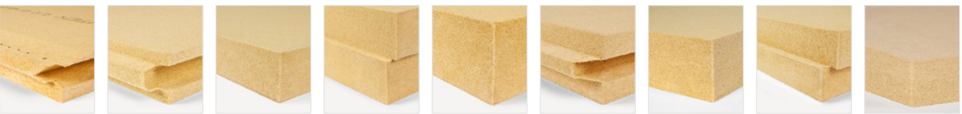
Ultratherm® Multitherm® Thermoroom® Thermosafe-homogen® Thermosafe-wd® Thermowall® Thermowall®-L Thermoflat® Pyroresist® wall