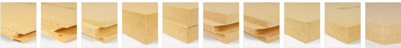
Multiplex-top® Ultratherm® Multitherm® Thermosafe-wd® Thermosafe-homogen® Thermowall® Thermowall®-gf Thermoroom® Thermoinstal® Pyroresist® wall